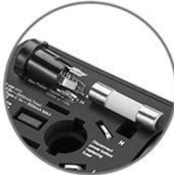
Open the fuse's cap with a coin or similar thin item