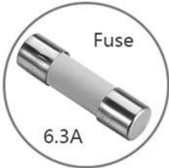
1 x Spare Safety Fuse